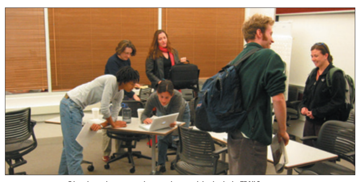
Education and computer science students participating in the TRAILS program at Stanford University. Students collaborate on educational software projects in actual K-12 classroom settings.

TRAILS performs educational research on how children engage in deeper problem solving, reflection, strategizing, generalization, and communication. Using this knowledge, TRAILS provides training and resources to undergraduate computer science and education students in order to help them develop interactive learning systems. Students in the program study a series of TRAILS modules, which focus on mutual understanding of educational requirements, shared elaboration of designs with modeling tools, building prototypes from components, and fieldtesting prototypes. SRI International provides