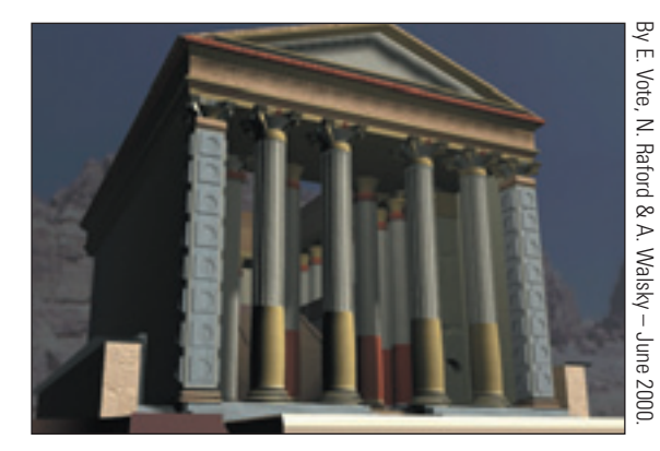
A view at the preliminary 3D reconstruction (temple proper) of the Great Temple in Petra, Jordan.

One of SHAPE's latest achievements was the creation of a life-size 3D model of the Great Temple in Petra, Jordan – a site under excavation for the past ten years. With glasses and a hand-held mouse, archaeologists can now explore the reconstructed site in Brown's 8 x 8 foot immersible virtual reality room, known as the CAVE. A desktop version is under currently development. "It is hoped that we