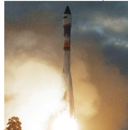
A Russian rocket similar to the one that fizzled. (The Russians confiscated all photos from the disaster.)

In a major setback for the European Space Agency, a Soyuz rocket carrying a satellite with 44 experiments exploded seconds after lifting off from Pletensk, Russia, on 15 October, killing one and injuring eight people.